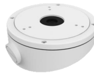
DS-1281ZJ-S Inclined Base Mount