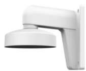
DS-1272ZJ-110-TRS Wall Mount